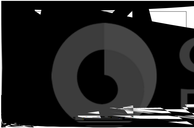
4: 1 1